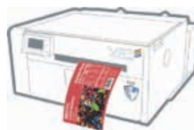
Print the label