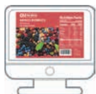
Design the label