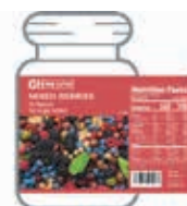
Paste on your product