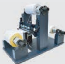
Matrix Remover & Slitter